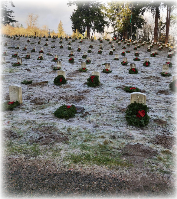
LAYING WREATHS AT THE SOLDIER'S CEMETERY IN ORTING FOR CHRISTMAS