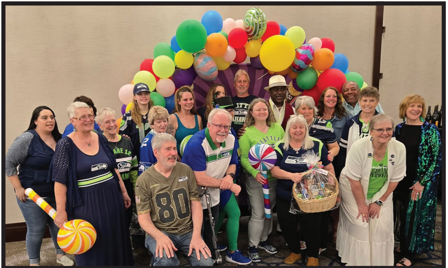
SOUTH SOUND SEA HAWKER MEMBERS AT THE ANNUAL SEA HAWKER'S BANQUET